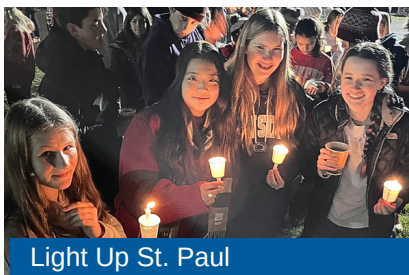
Light Up St. Paul