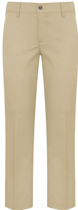
Irvington Flat Front Stretch Dress Pants