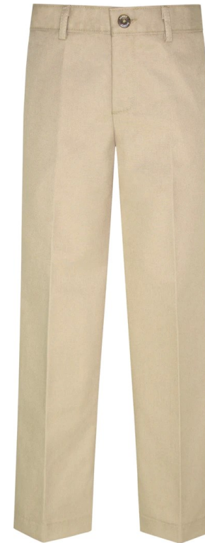
Irvington Flat Front Dress Pants