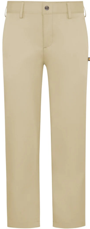
Tech Twill Flat Front Pants

All boys must wear a belt. Accessories can be found on the Dennis Uniform website.